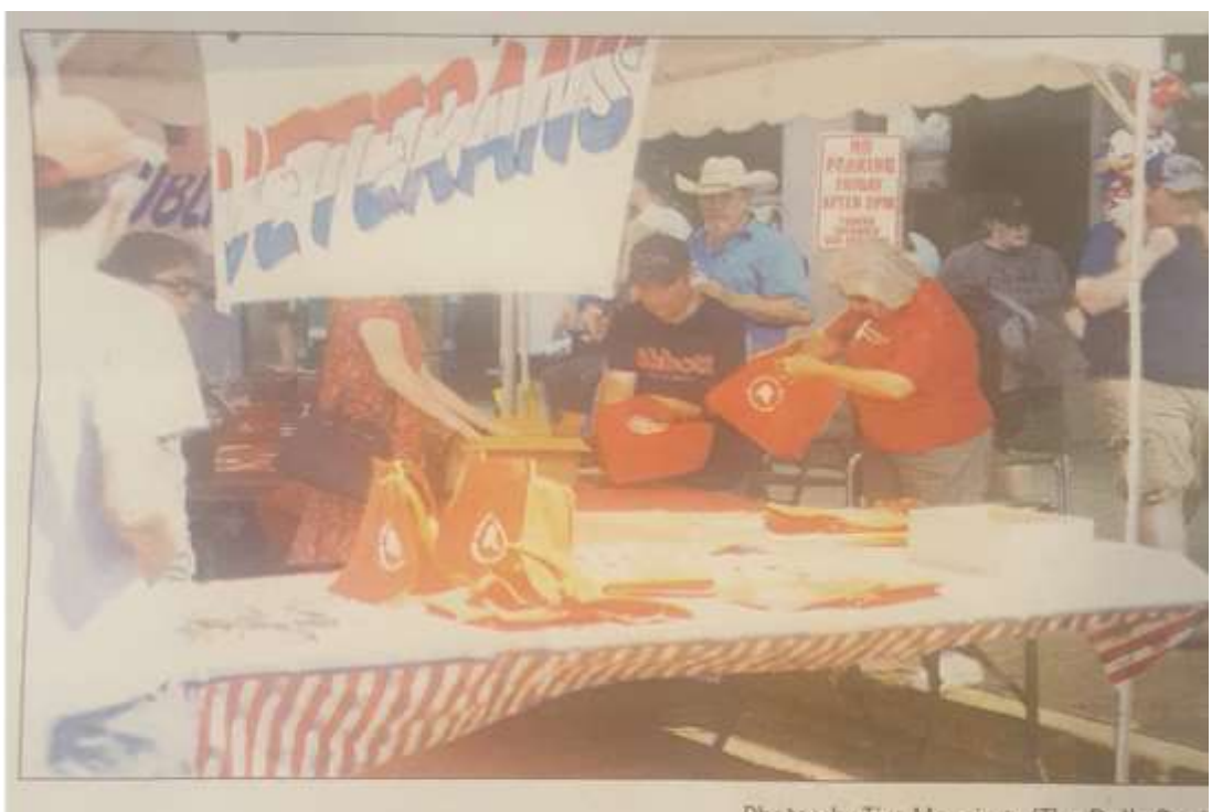
Nacogdoches County Republican Women members stuff reusable bags with campaign a informational materials to hand out during the 29th annual Blueberry Festival Saturday.