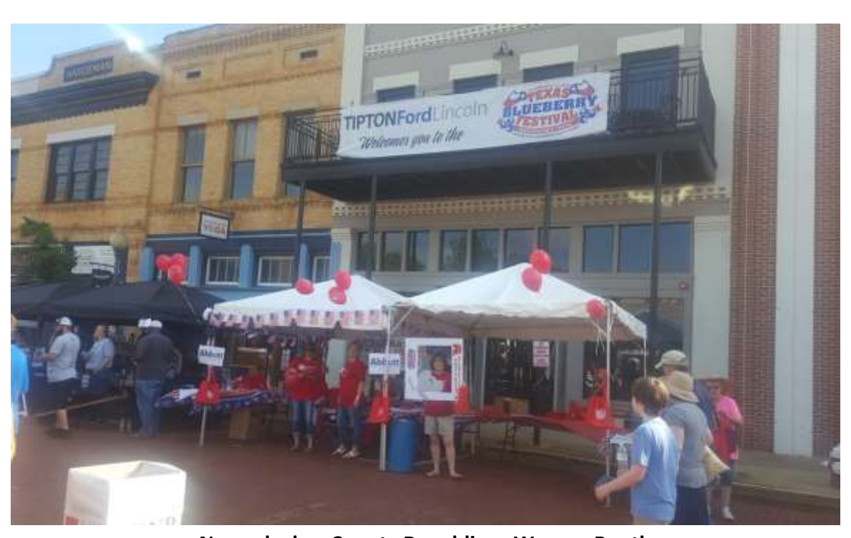
Nacogdoches County Republican Women Booth