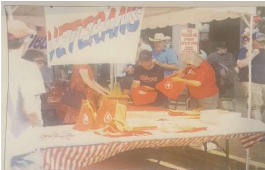
Nacogdoches County Republican Women members stuff reusable bags with campaign and informational materials to hand out during the 29th annual Blueberry Festival Saturday.