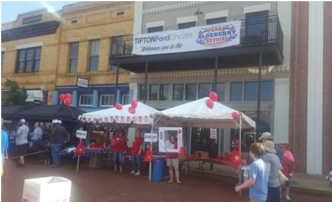
Nacogdoches County Republican Women Booth